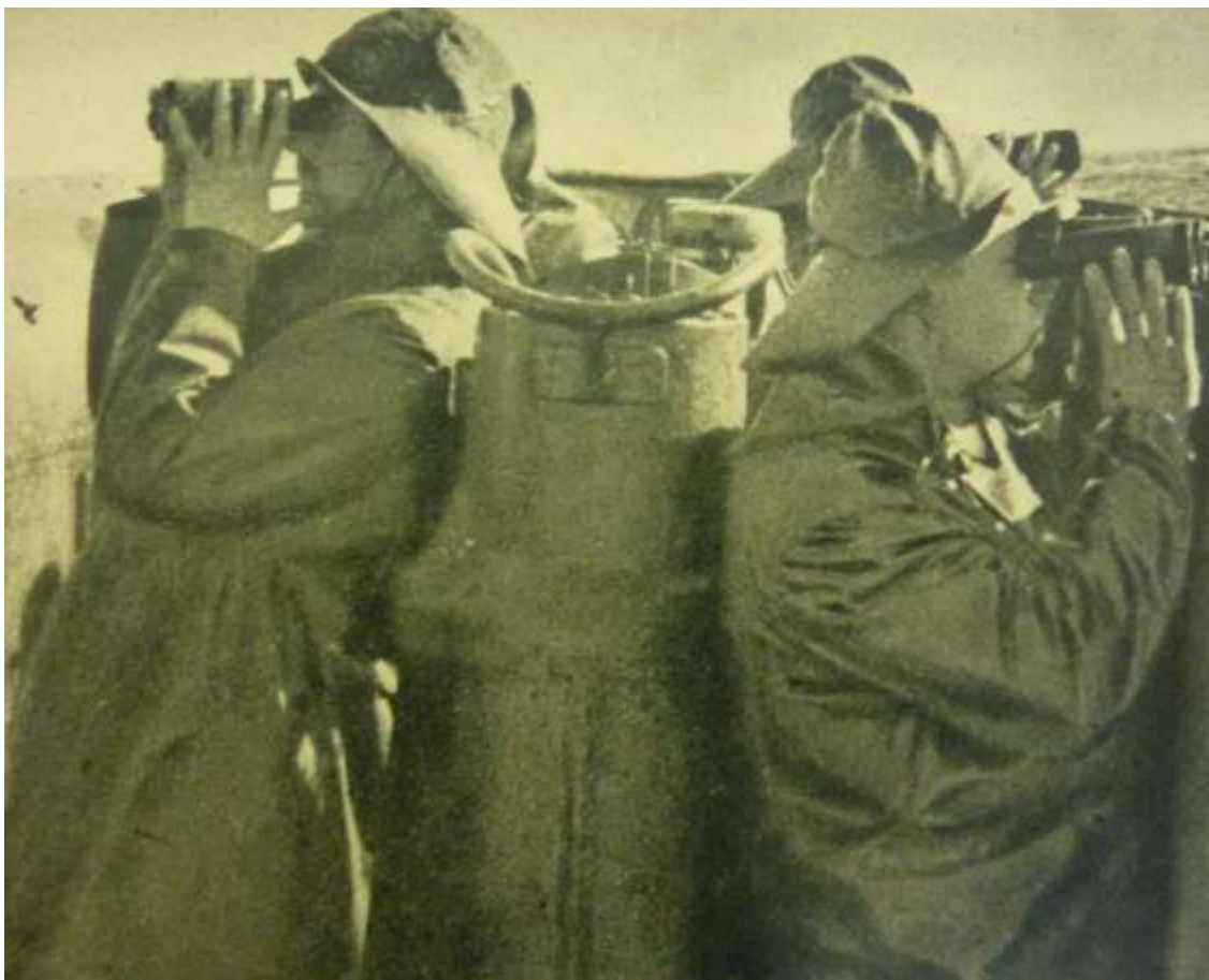
The picture from "Signal" Magazine edition – H10 1942 page 15 (in our collection)

The complete U.D.F. 7 x 50 from our collection; Copyright pictures Anna Vacani The binocular was built up for U-boats. It was mounted on the surface attack torpedo aiming device.