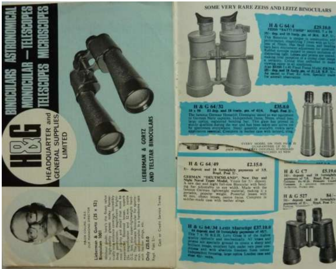
Picture of the catalogue from c.1972 from our collection

At the present time it is very collectable binocular. It is very hard to find this binocular in a good condition and complete with the rain hoods.