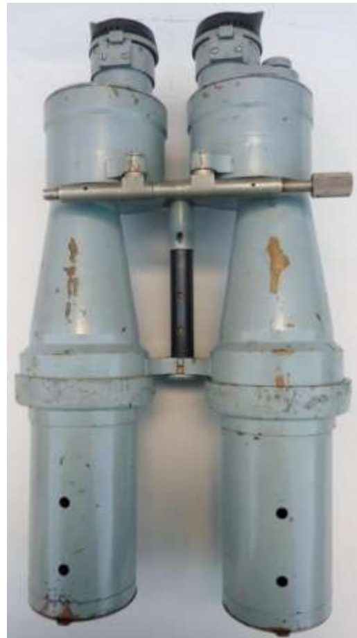
Both sides of our binocular