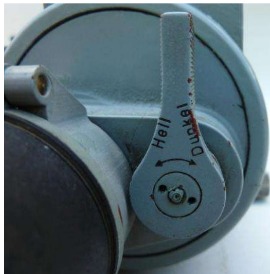
The external lever of the illumination mechanism

At that time in the German army were applied two illumination sources: incandescent lamps and radiant paint. The radiant paint is losing luminosity after fifteen to twenty years of manufacturing. The adjustment lever of the illumination mechanism is on the right plate of the binoculars.