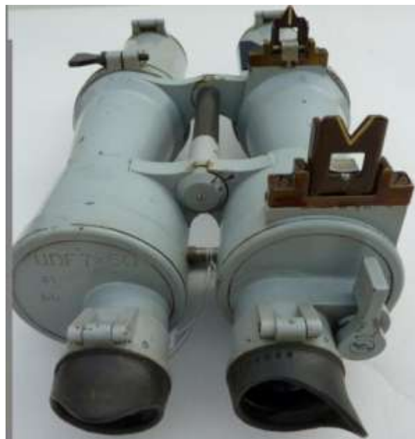
The complete U.D.F. 7 x 50 from our collection