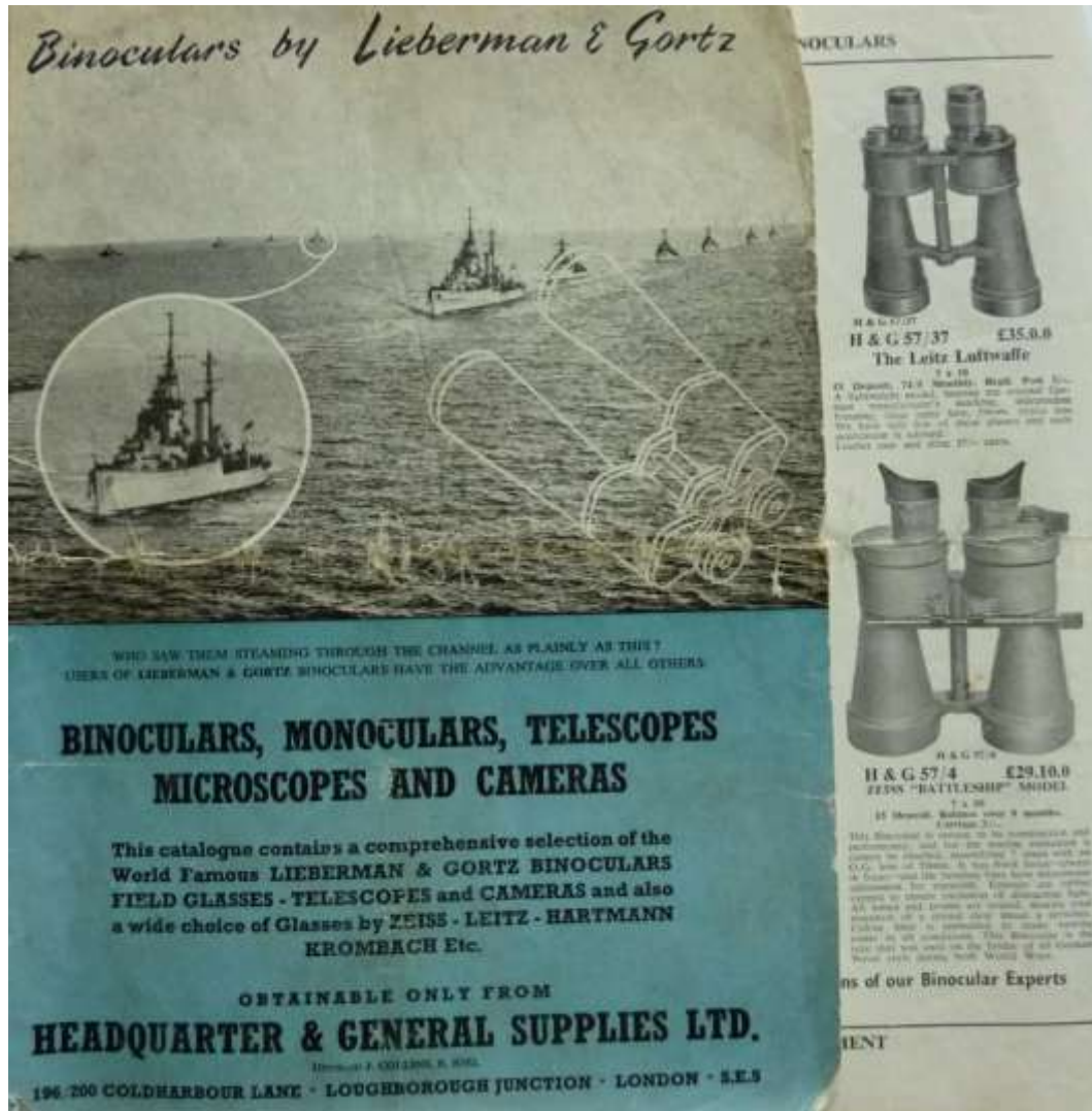
Picture of the catalogue from c.1955 from our collection

battleship model binoculars', in London by 'Headquarter and General Supplies Limited' and in Scotland' by 'Charles Frank Glasgow'.