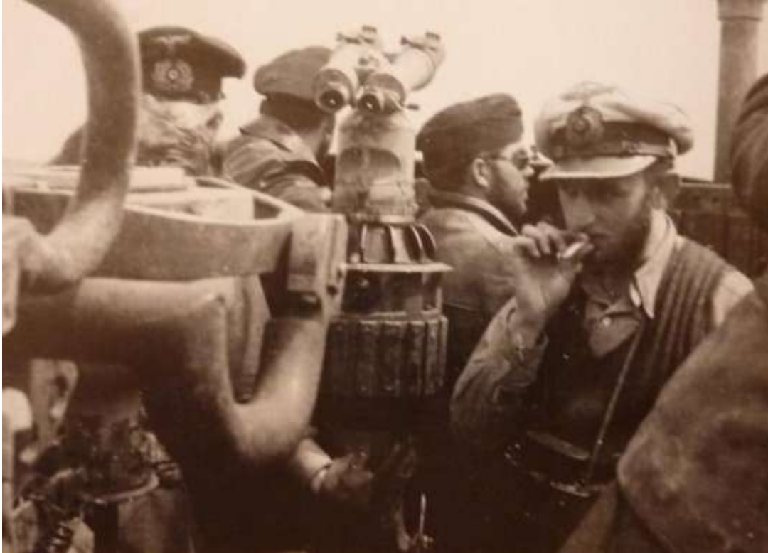
Picture 1; UDF mounted on the UZO; the picture was taken in April 1942, on U-373