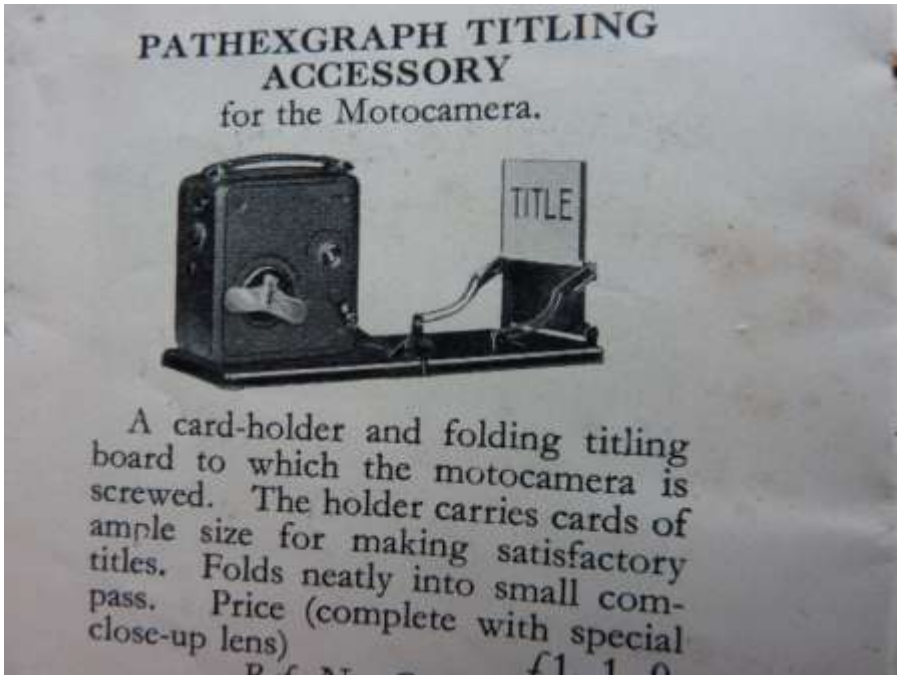
The picture from 'Pathescope'1932- in our collection