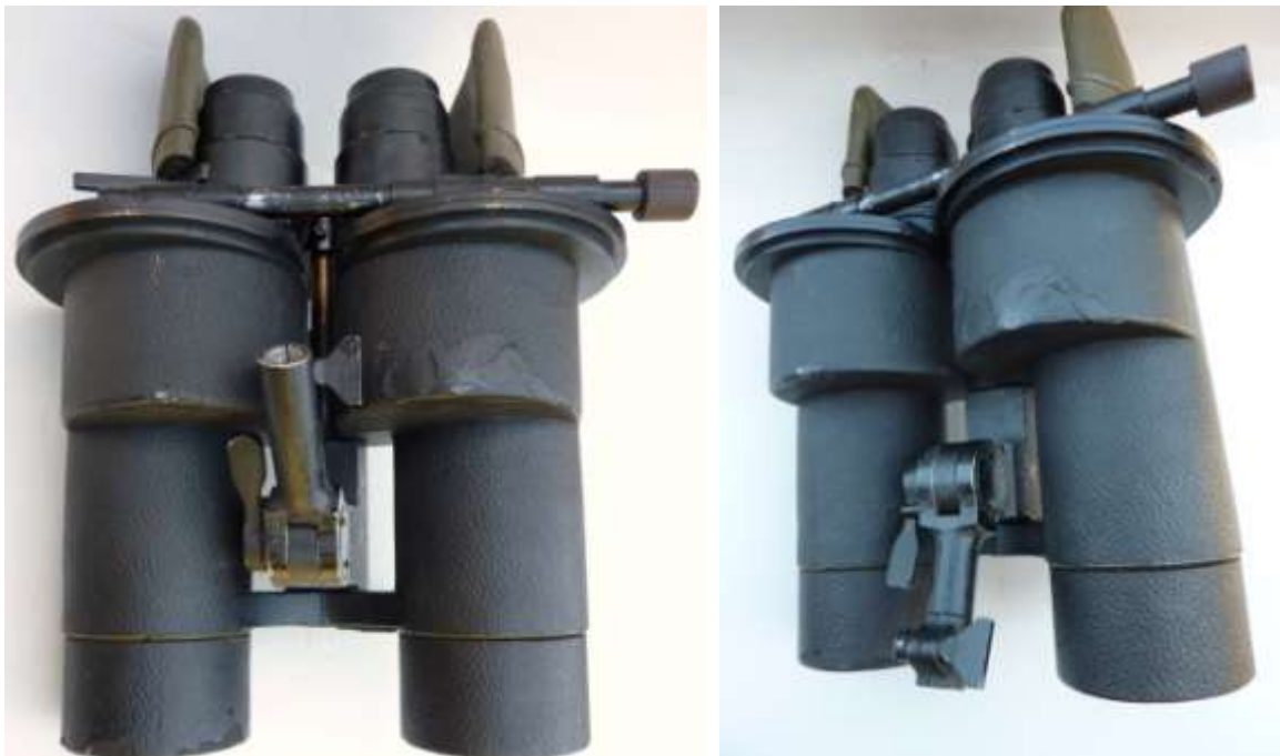
The mounting bracket; Copyright pictures Anna Vacani

The binocular is fixed with the short type mounting bracket with vertical locking clamp: