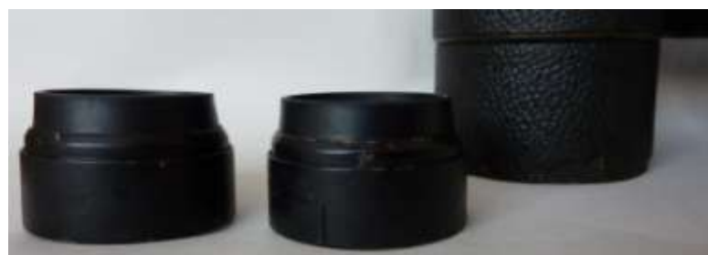
The eye cups

The objectives are fixed with the hoods; individually for both objectives.