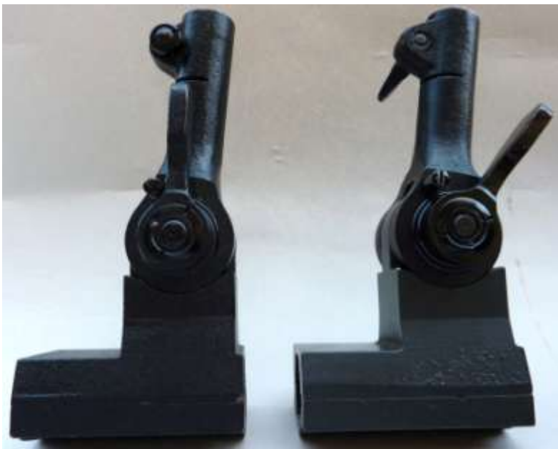
The mounting brackets