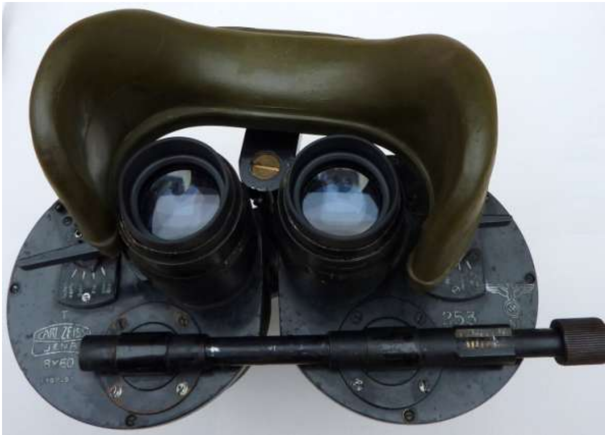
The binoculars' top with headrest

8 x 60 Carl Zeiss Deck Mounted, production No. 1787295 – from our collection.