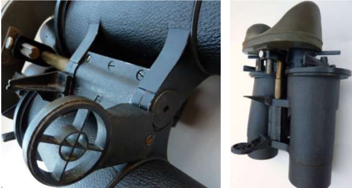
The ring sight

The ring sight mounted on the binocular is complete: