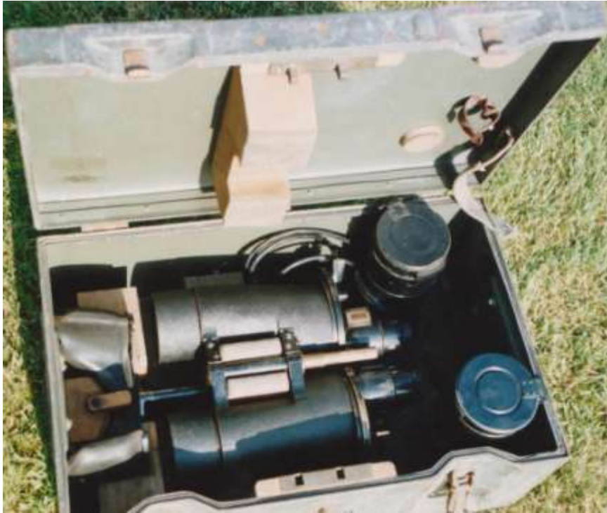
Pictures in our collection

The headrest, on our binocular, is not original, and the mounting bracket as well. All mechanisms are working well. The body is covered with vulcanite plastic imitation leather. In some places it is missing, and the missing parts are covered with a black paint.