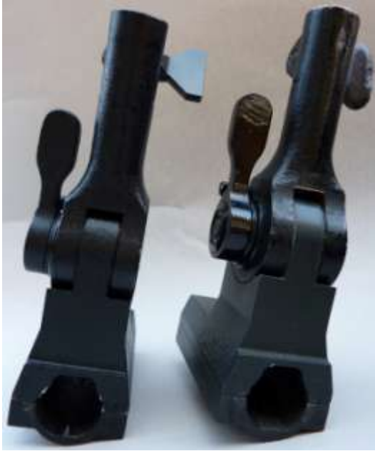
The mounting brackets